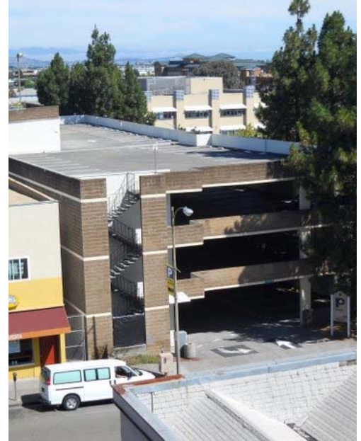
3rd & A Street Garage

Avoid the time restriction of parking meters. This card is perfect for anyone who is regularly in the City but not here so often that monthly parking makes sense. It's a convenient way to save money on your downtown parking visits. Give us a call at 415-458-5333 for more information or to purchase your own card.